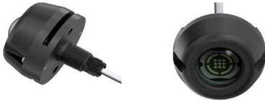
Hurley Drain Plug / Puck Light

Hurley Drain Plug Lights / Puck Light™ raise the bar on range and brightness that rivals any other underwater light on the market.